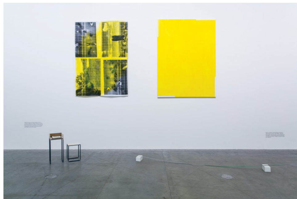
Numbers throughout refer to published list of works.