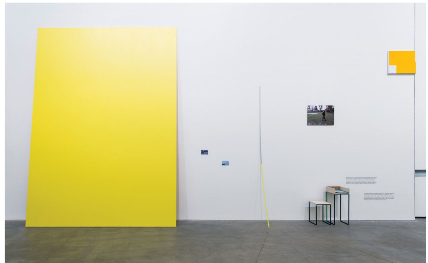
Previous page: View through Project Room 1 (south)