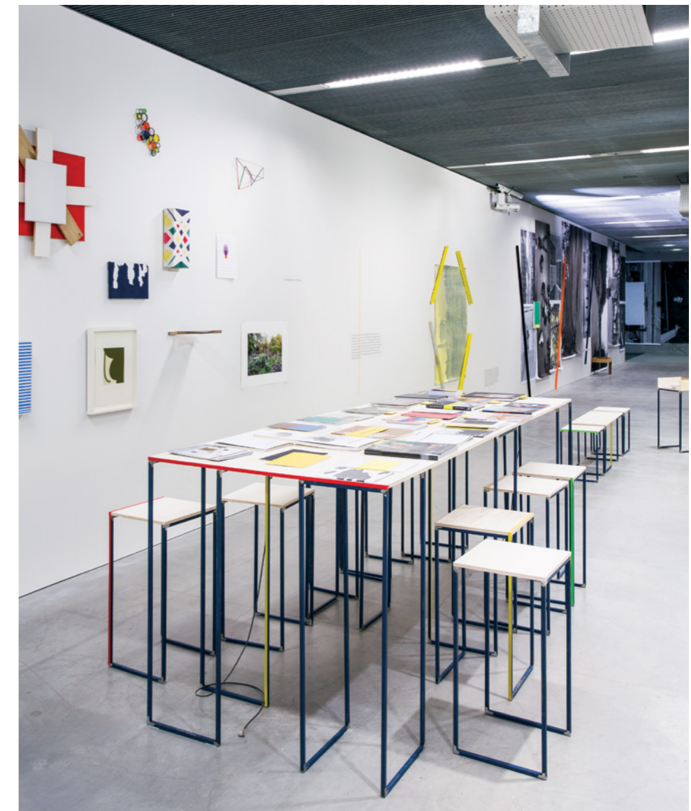
Opposite page: Project Room 2 is a studio-like space with interactive tables. Top: 56-54, bottom: 84-79, A and B.