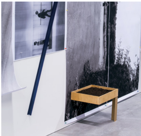
This page: View through Impermanence Installation. Top and bottom left 74 and 77, bottom: 77 (detail).