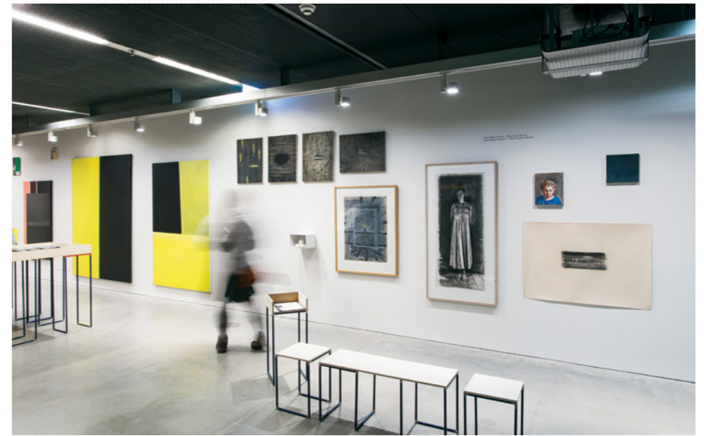
This page, top left and right: View across 'bridge' to Project Room 1. Middle: 38-50, bottom: looking north through Project Room 2.