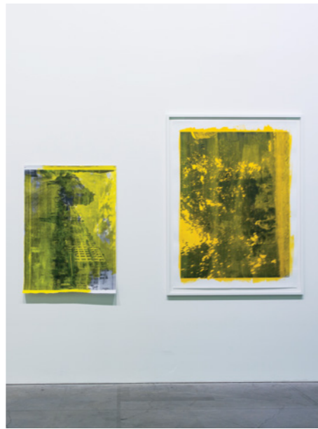
Opposite page: Project Room 1. Top left and right: 19, middle right: 24-25, bottom right: 32, 26, 31, bottom left: 31, 34