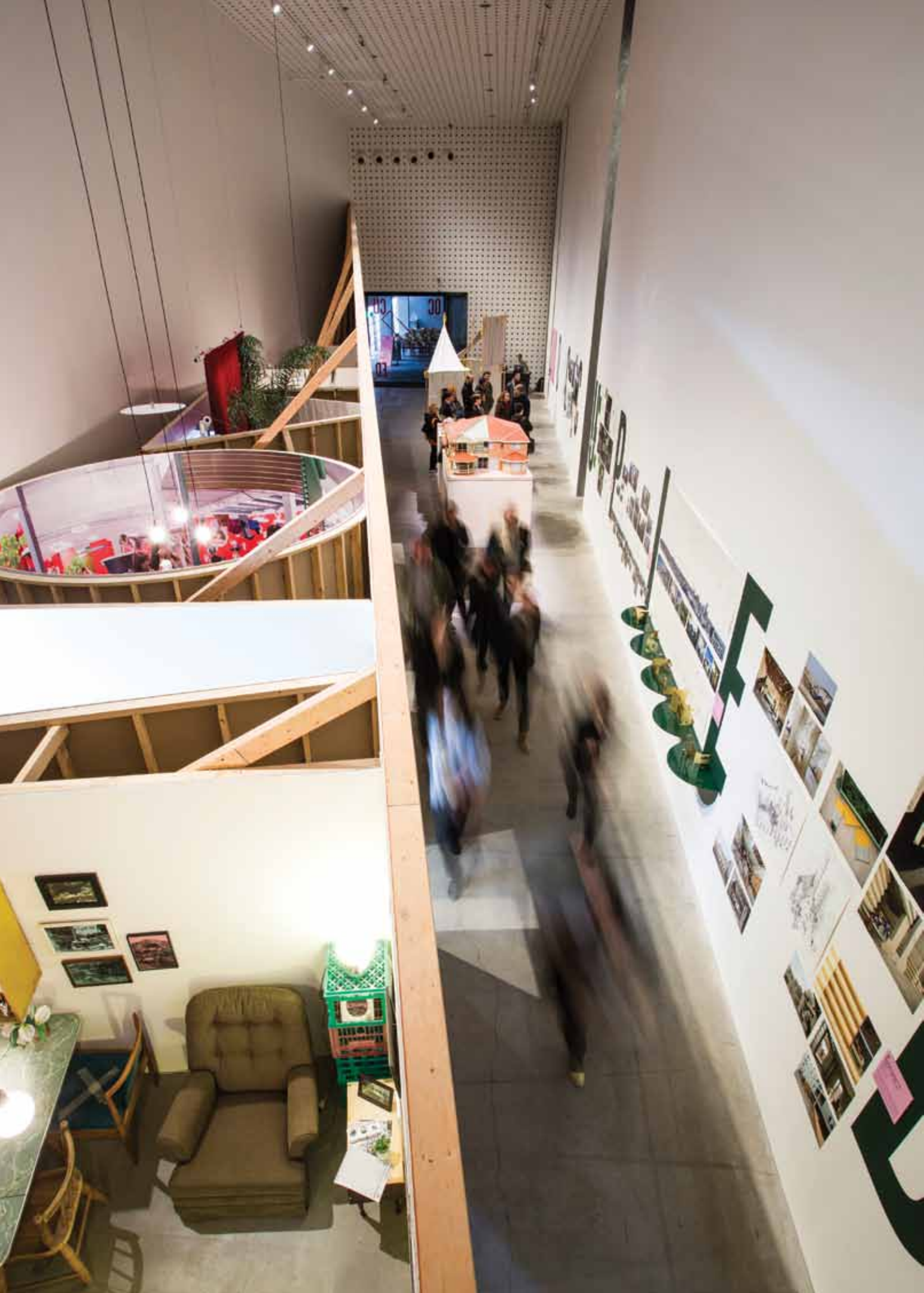
Front cover: Occupied , view of large-scale wall installation with 'interior' rooms.