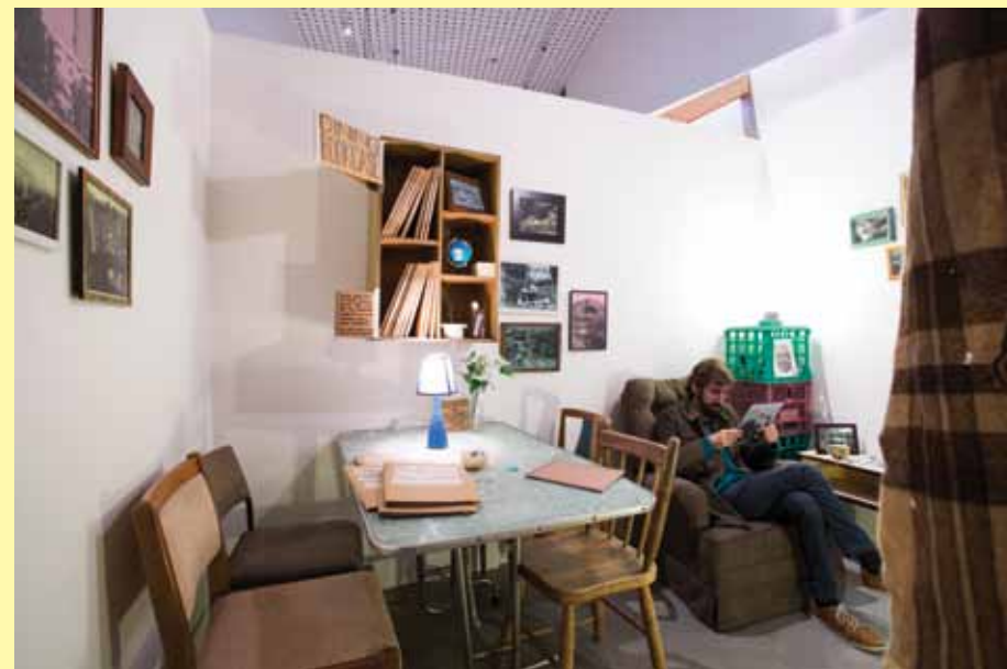
Opposite Left: Sala Beckett Theatre and Drama Centre (pre-occupation) Flores & Prats 2011–2016